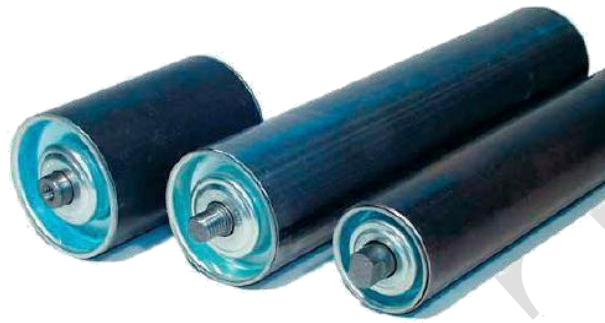
Fig: PVC Pipe Roller

In this project we use the rollers made from PVC Pipe Roller. The main purpose of roller is that to guide or circulate the cleaning cloth. In this project seven rollers are used of having diameter 45mm and length 1.5 feet. Cost of each roller is 200 rupees.