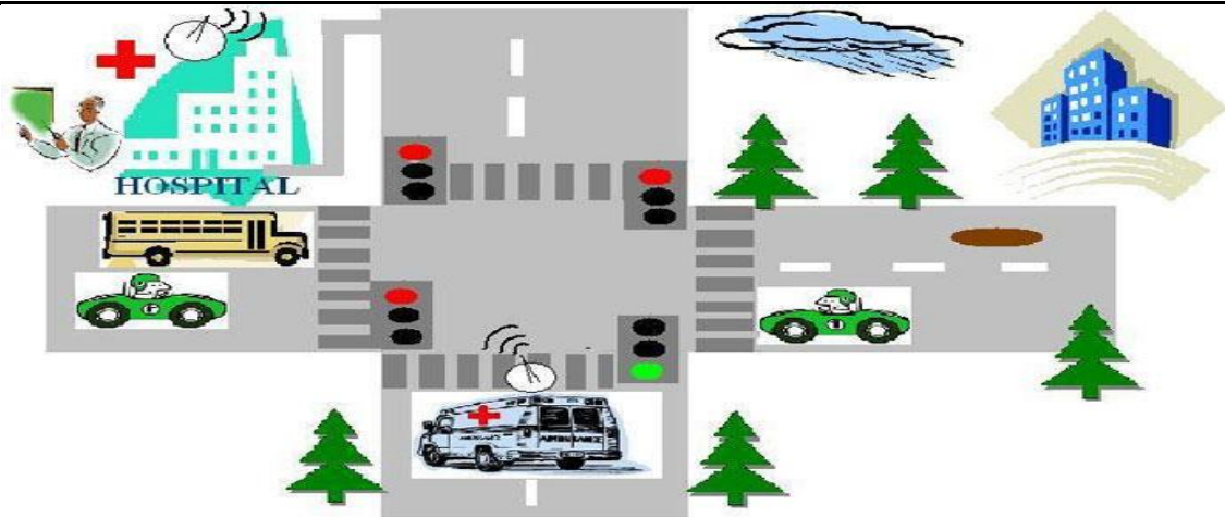
Fig. Typical view of traffic system

By using auxiliary controller we can control signals manually in case of any emergency or failure of automatic control system.