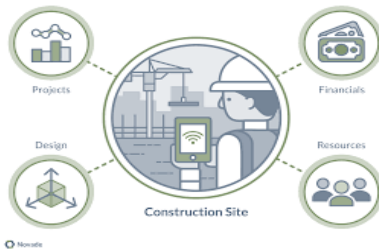
Fig.1: ICT in Construction Management

The ICT applications for construction management can be widely considered in four categories viz. Project, financial, resources and designing and controlling. The onsite activities can be monitored and the instructions can be given for the improvement of the day to day activities. The designing and the improving the designs is easy with the ICT tools. The end user can specify the requirement in designing phase and can suggest the changes as per need during the design phase only.